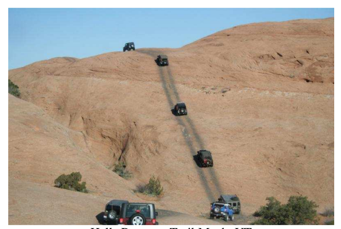
Hells Revenge Trail Moab, UT