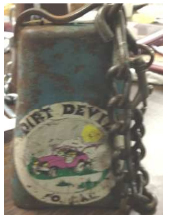
1 Old green cow bell.