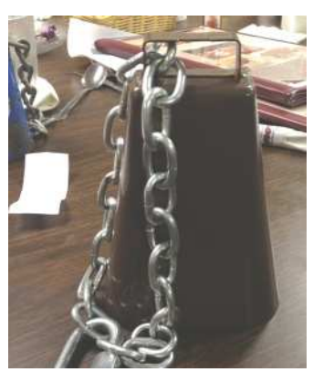
3 new brown bell

The cow bell rules are: If you get stuck and are unable to move under your own power and need the help of a winch or you get strapped from one of your fellow jeepers then you have earned the privilege of hanging a cow bell from your front bumper. You must leave the cow bell on the front of your rig until another Dirt Devil gets stuck then, you can proudly hand it over.